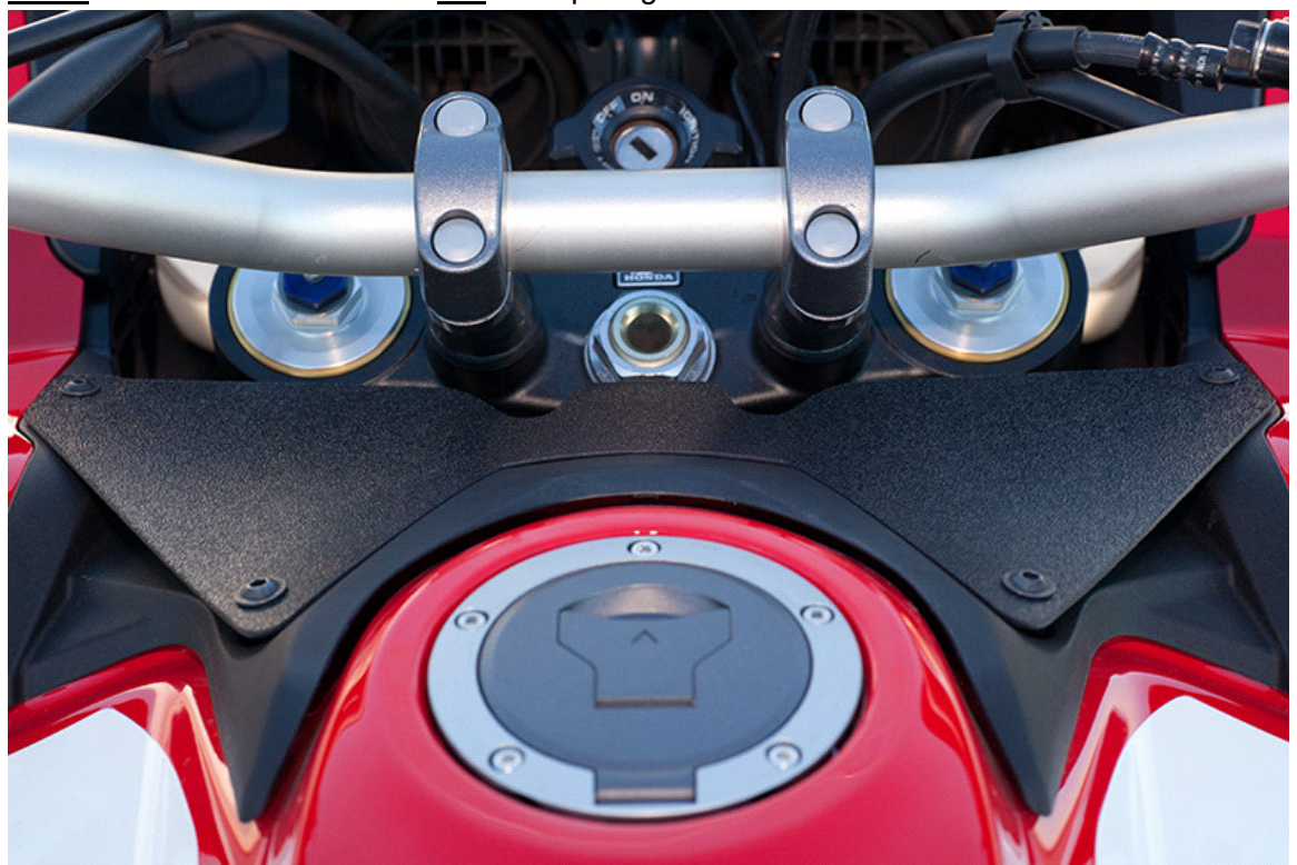
6.) Check that nothing is blocking the steering and enjoy a testride with your bike :-)

5.) Tighten the front screws with a 3mm Metric hex key now Note: The front screws should not be super tight